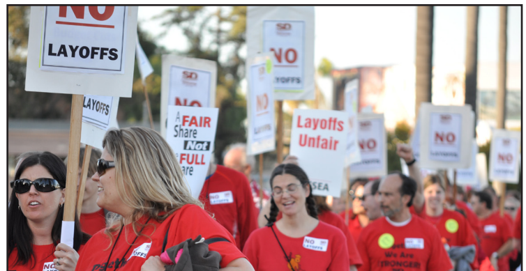
Roughly 1,200 SDEA members packed the Board meeting and picketed out front to protest layoffs.