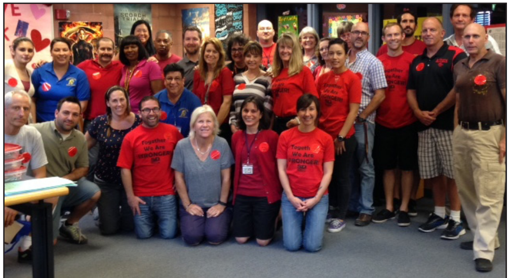
SDEA members, parents and students at Oak Park Elem. (top) and Clark MS (above) took a stand for public education as part of the national Walk In to Reclaim Our Schools.