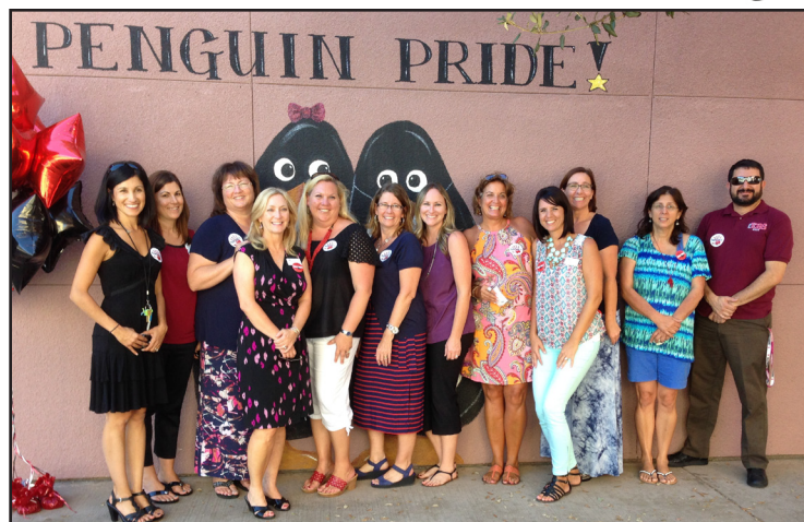
Members at E.B. Scripps Elem. rocked Fight for 5! stickers on the first day of school as part of a union-wide solidarity action.

SDEA's bargaining team will be taking the Fight for 5! back to the bargaining table next Thursday, Sep. 18. If we want to